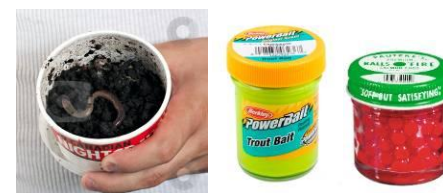
Bait used at Strawberry: Earthworms, Power Bait, Salmon Eggs

I usually tip my jig or lure with a piece of earthworm.