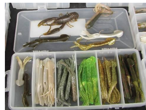
Crawdad Pattern, Tube Jigs

My hooks of choice at Strawberry are tube jigs, crawdad patterns, and lures and spinners. I also put an earthworm on my hook as well. The colors I have had the most luck with are gold, silver, white, and dark green. I also like a brass colored lure called "Jake's Lure."