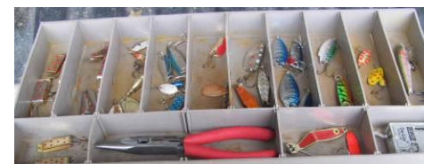
Various Lures and Spinners (My favorite lure, "Jakes" is on the far left.)